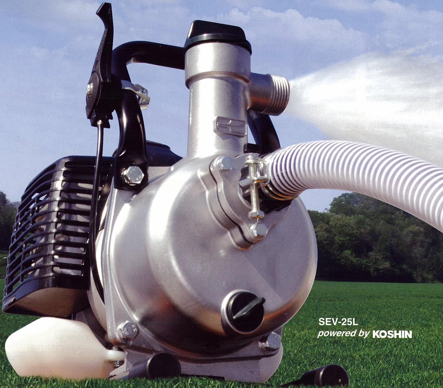
SEV-25L powered by KOSHIN